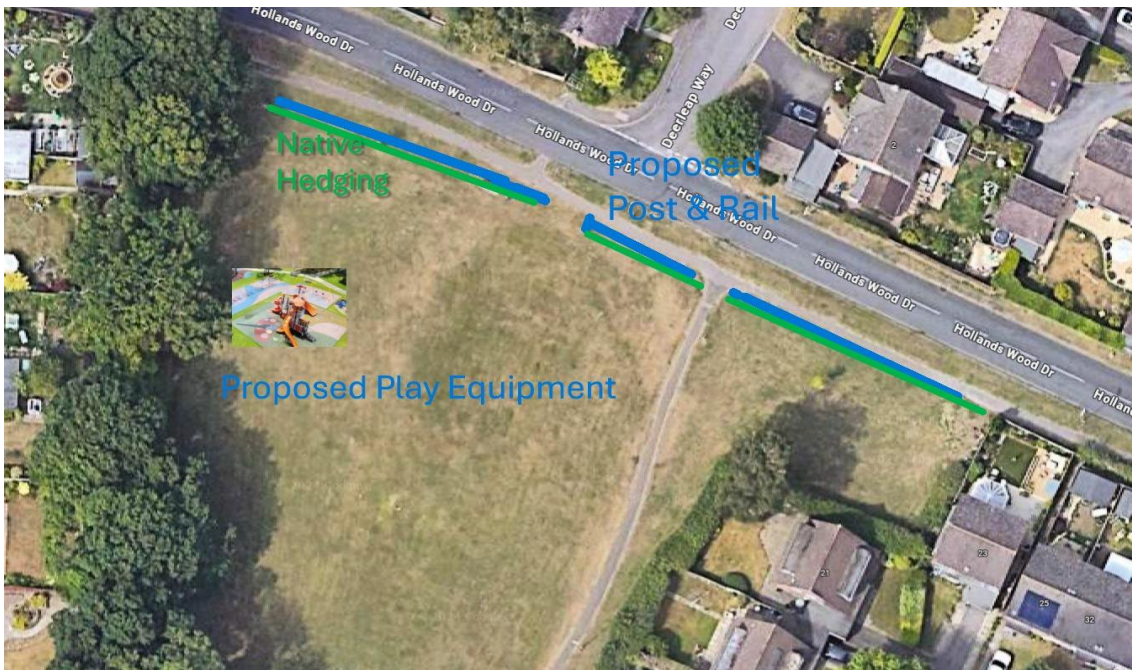
Total CIL Bid £41,550

Hollands Wood Drive – Provision of Inclusive Play Equipment, Post & Rail Fencing and Native Hedging, as shown below.