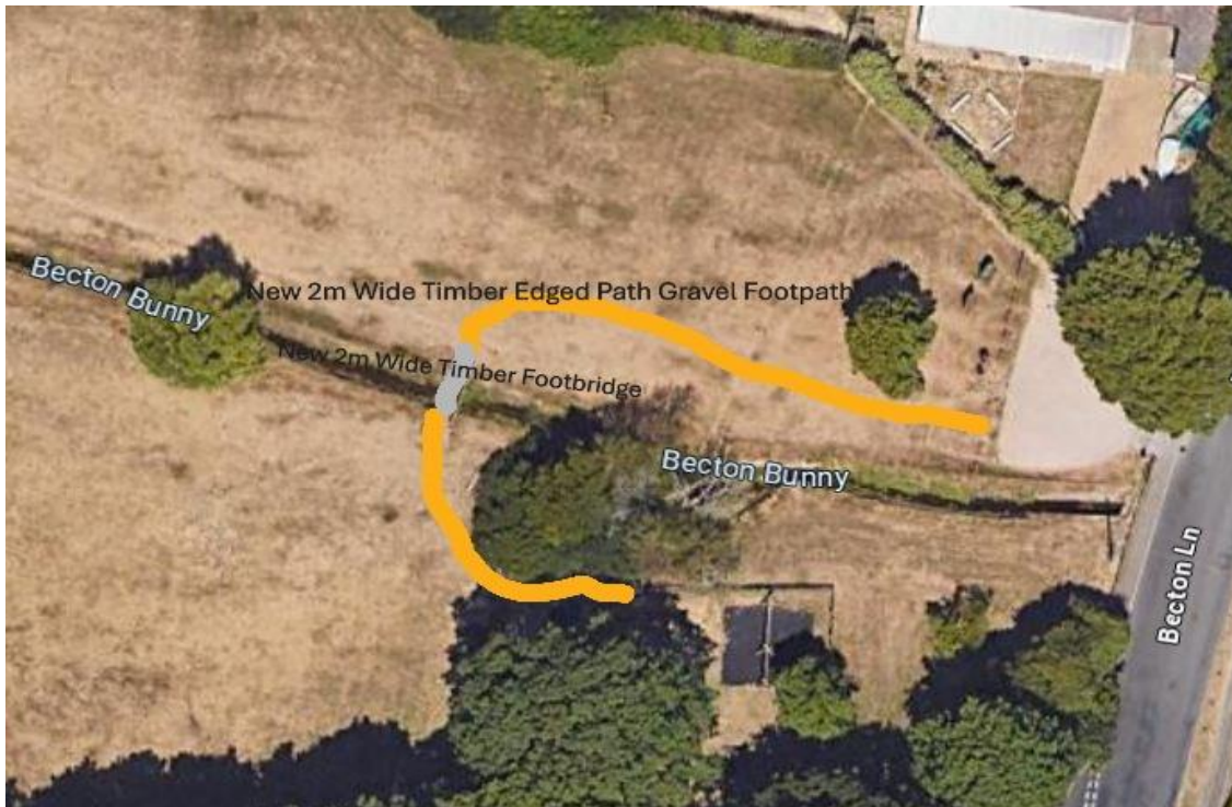
Total CIL Bid £20,000

Long Meadow – Provision of New Footpath and DDA Compliant Footbridge.