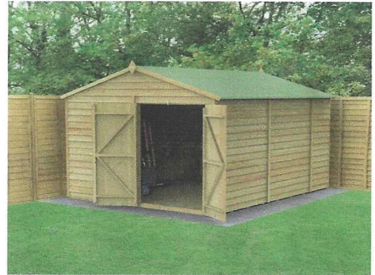
Wooden Shed 10'x8' with green felt roof